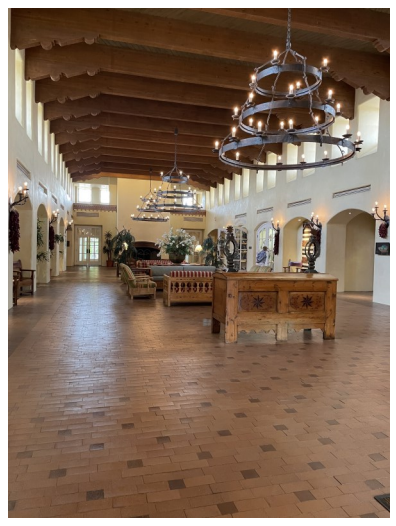
Hotel Albuquerque Lobby