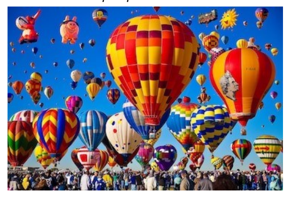
Albuquerque Balloon Fiesta

One thing in particular was the lack of sufficient For additional interesting information regarding the tourniquets due to the overwhelming number of Reno Air Races Association, please check out their amputations caused by the flying debris; Nurses web site at: <a href="https://airrace.org/">https://airrace.org/</a> and consider quickly went through the crowd and collected belts attending this year's Air Races Sept 14-18, 2022 in to be used for tourniquets. Amazingly, all Reno at Stead Airport.