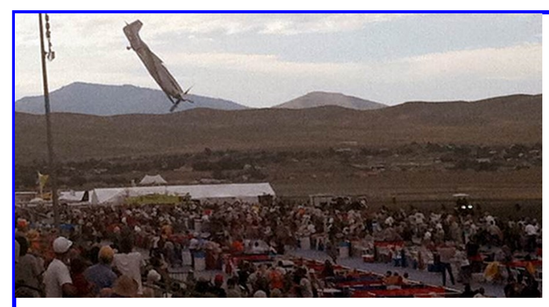
Galloping Ghost crashing into the spectator section at Reno in 2011

One thing in particular was the lack of sufficient tourniquets due to the overwhelming number of amputations caused by the flying debris; Nurses quickly went through the crowd and collected belts to be used for tourniquets. Amazingly, all seriously injured patients were transported quickly to the Trauma Centers and the last patient moved was under 50 minutes. All of these talks were recorded and if you missed them, I encourage you to get a copy of the Audio/Video and Slides from the Podiumcast website listed in our Newsletter.